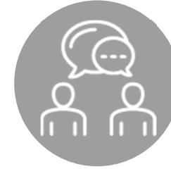
11 Program Days