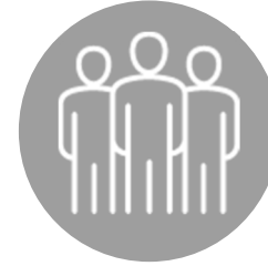
Opening Retreat Events