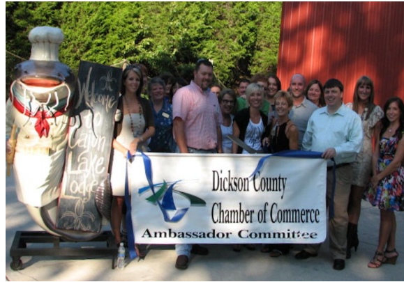
Ribbon Cuttings are displayed in the Chamber Chatter newsletter, The Dickson Shopper and the Dickson Herald.

luncheons/coffees, annual membership banquet and annual industry appreciation golf tournament.